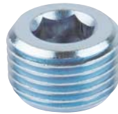
STAINLESS STEEL / EDELSTAHL