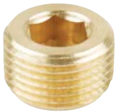
BRASS / MESSING