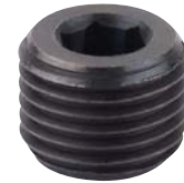
STEEL / STAHL